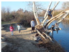
Friends & Family

A $106.7 million rail improvement project that is winding its way through the approval process would increase freight train traffic through the Tehachapi Pass by about 80 percent by 2020.